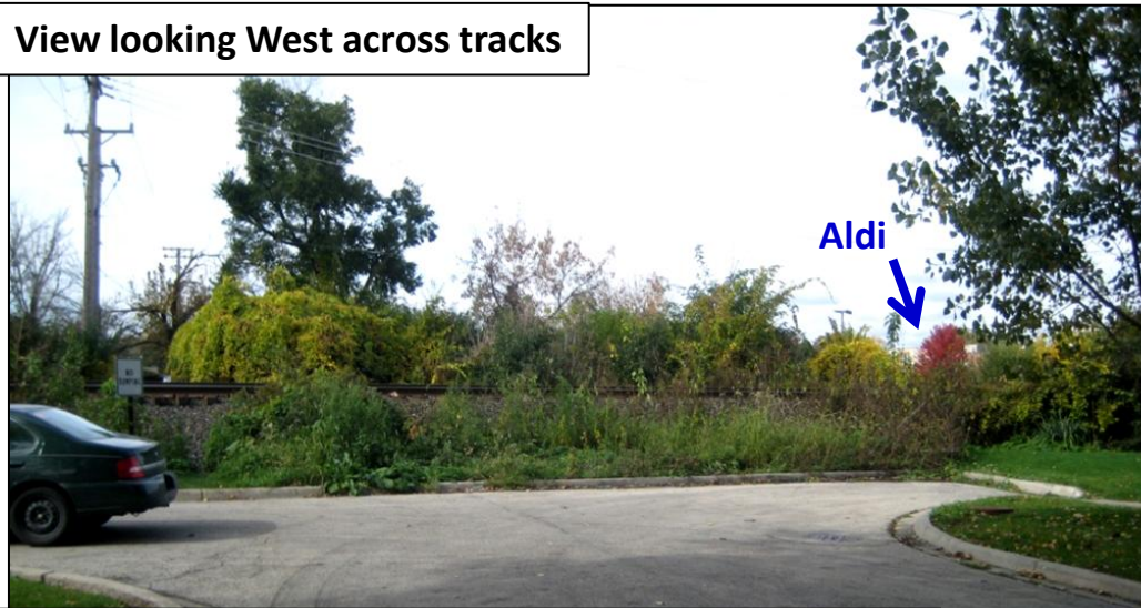
View looking West across tracks

A pedestrian- & bike-only rail crossing of the Canadian National line on Forest Ave. is a great opportunity. Forest is a quiet residential street midway between Algonquin and Oakton. There is a large residential area East of the track, and on the West is a growing commercial area along Lee, with numerous new shops, Aldi market, Boston Fish Market, etc. A pedestrian-only crossing here would create a short-cut for shopping on foot, and would increase foot traffic at these businesses. Further West, Forest Ave. provides a safe route to Forest and Algonquin Schools (D62) and Maine West High School. The crossing would thus create a safe route for students to get to these schools without using the much busier Oakton & Algonquin arteries. A new traffic light planned at Forest and Lee will further enhance the value and safety of this route.